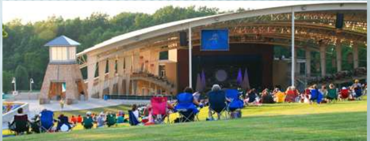
Constellation Brands-Marvin Sands Performing Arts Center